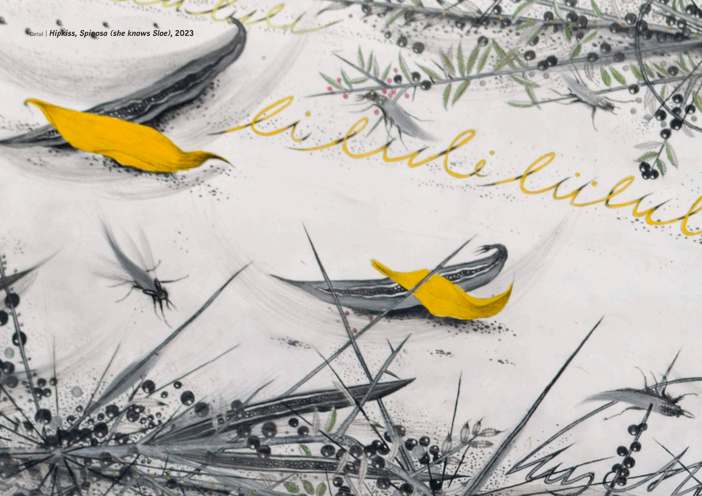
Detail | Hipkiss, Spinosa (she knows Sloe) , 2023