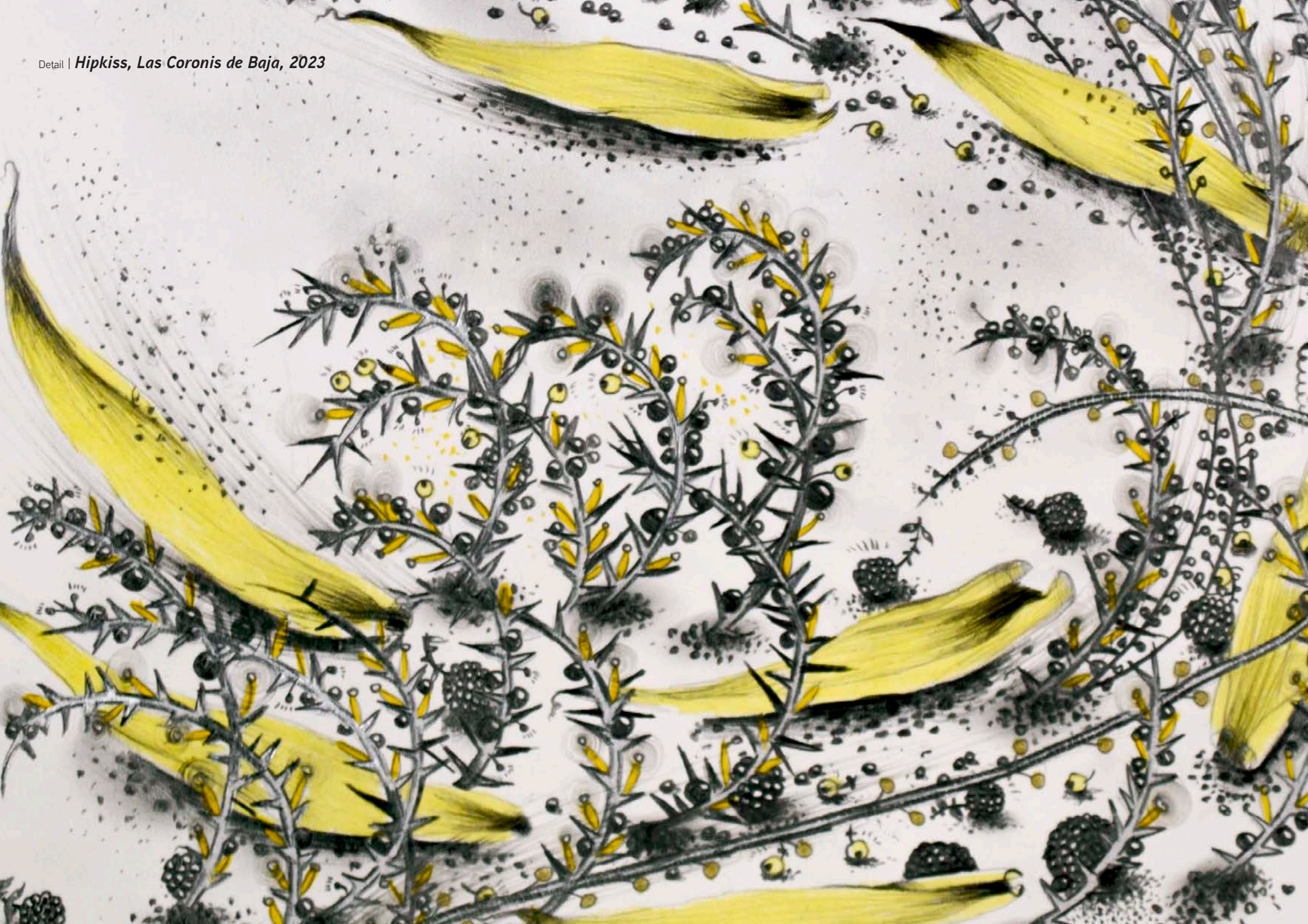
Detail | Hipkiss, Las Coronis de Baja, 2023