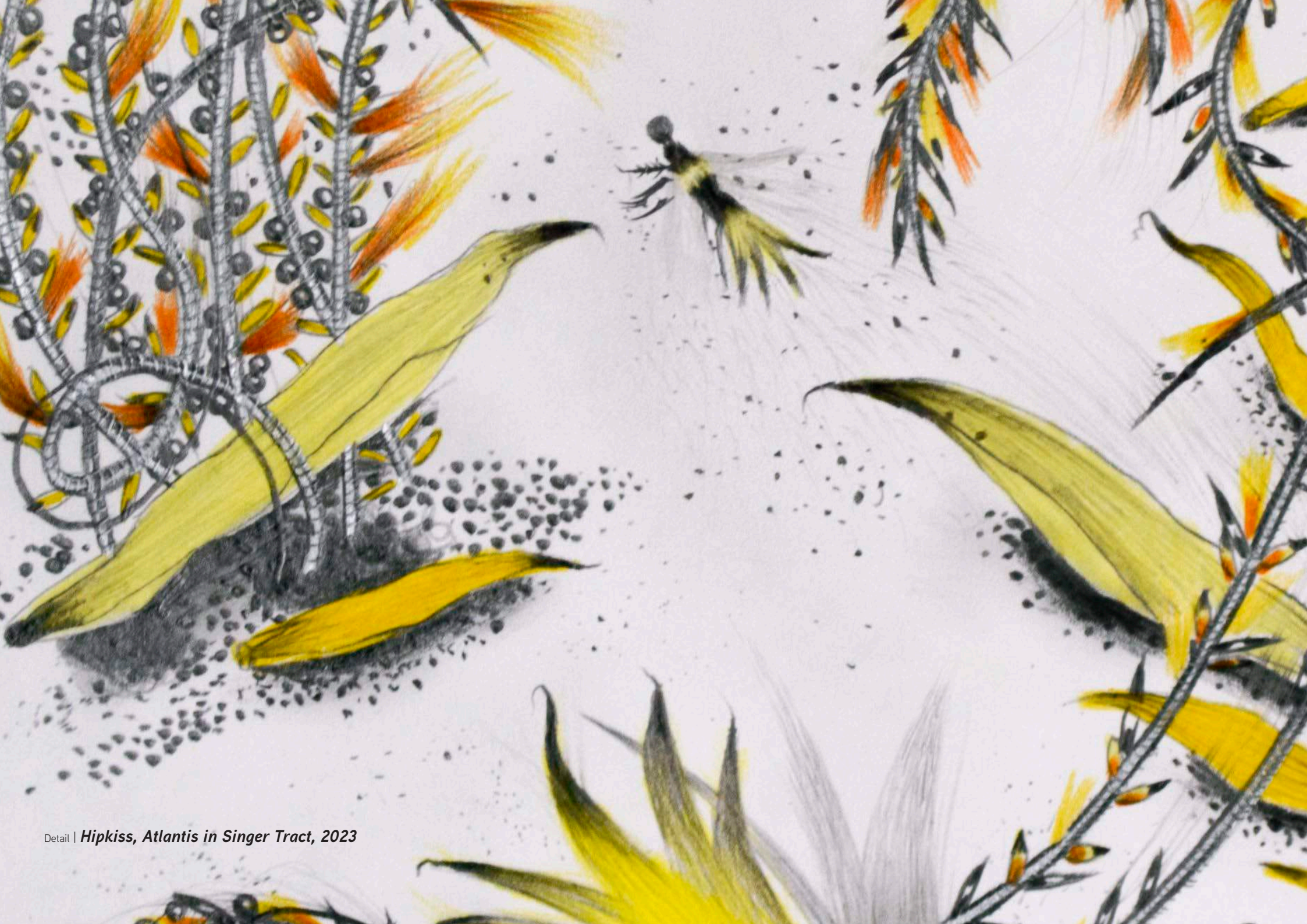
Detail | Hipkiss, Atlantis in Singer Tract, 2023