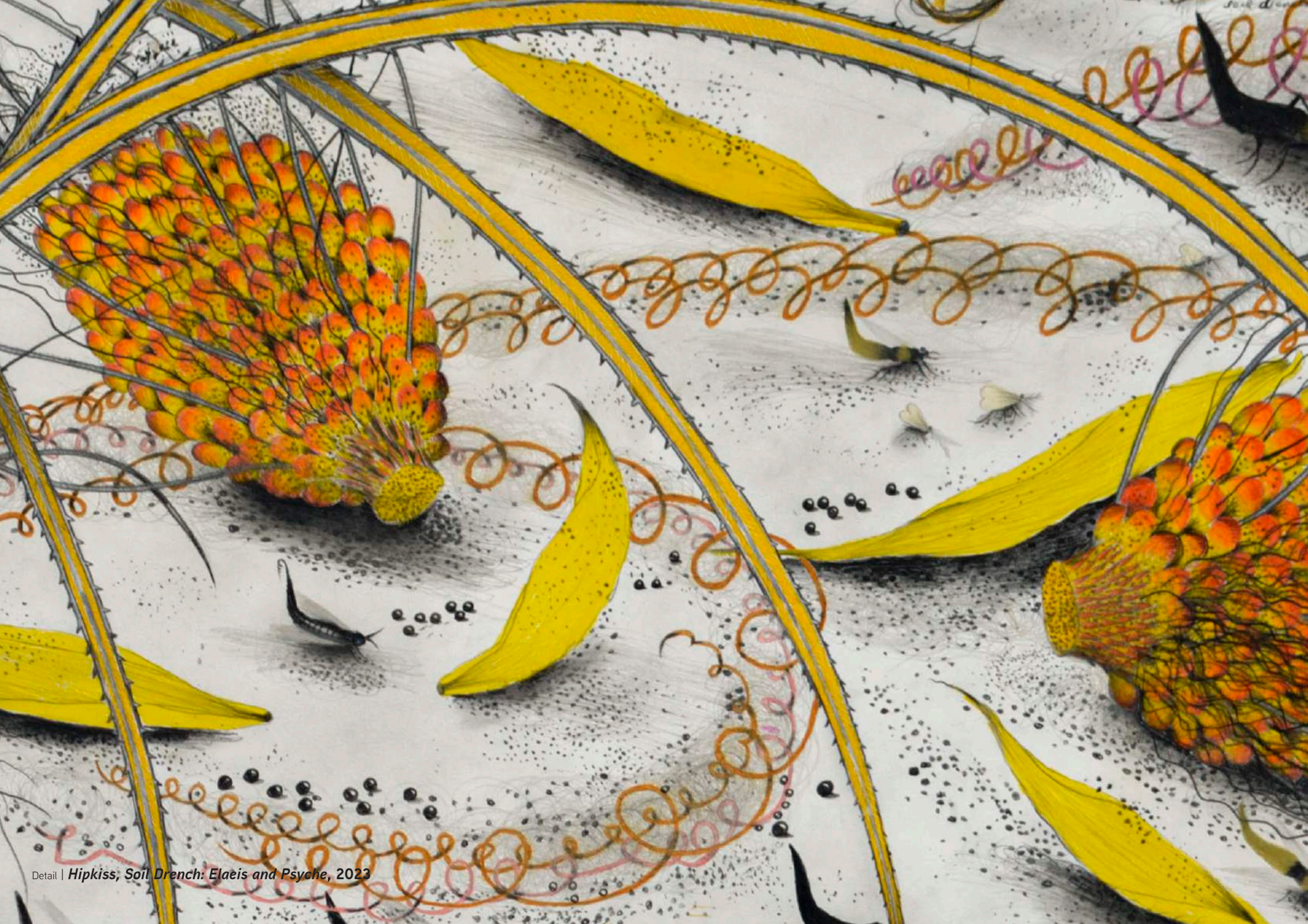
Detail | Hipkiss, Soil Drench: Elaeis and Psyche , 2023