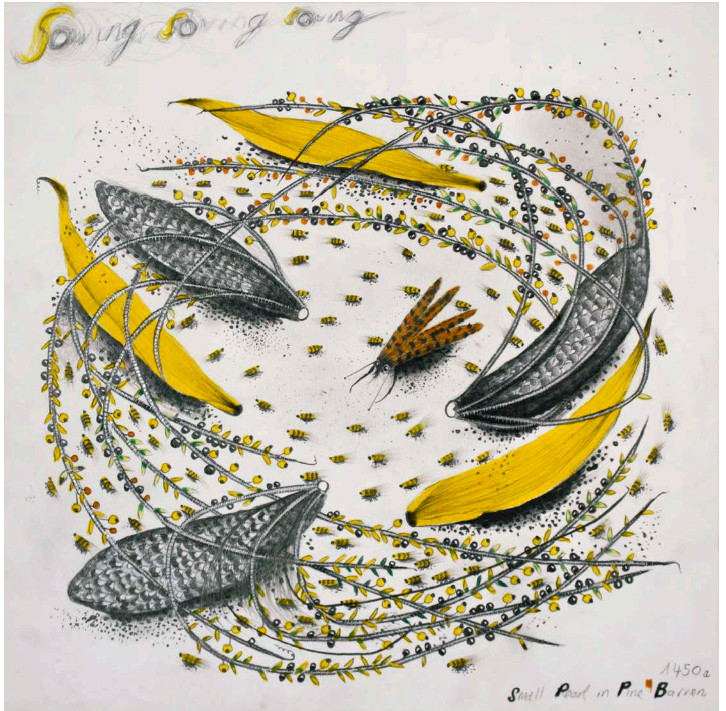
Hipkiss, Small Pearl in Pine Barren , 2023 Graphite, silver ink, metal leaf and colored pencil on Fabriano 4 paper 25 x 25 cm | 9 3/4 x 9 3/4 in