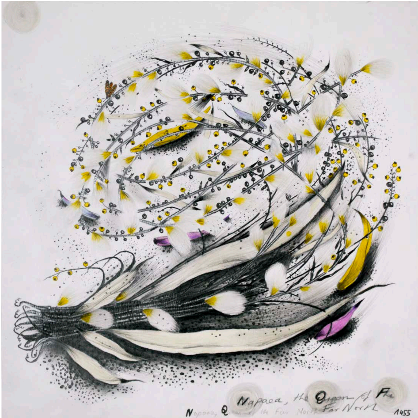
Hipkiss Napaea, Queen of the Far North, 2023 Graphite, silver ink, metal leaf and colored pencil on Fabriano 4 paper 25 x 25 cm | 9 3/4 x 9 3/4 in