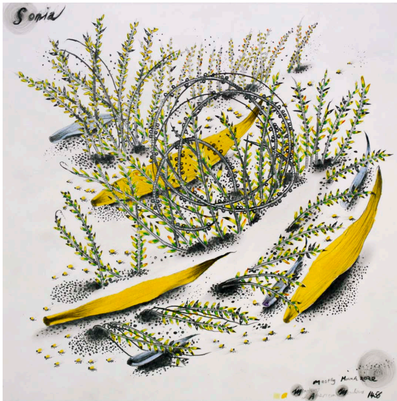
Hippiess Meadows in the American Meadow, 2023 Graphite, silver ink, metal leaf and colored pencil on Fabriano 4 paper 25 x 25 cm | 9 3/4 x 9 3/4 in