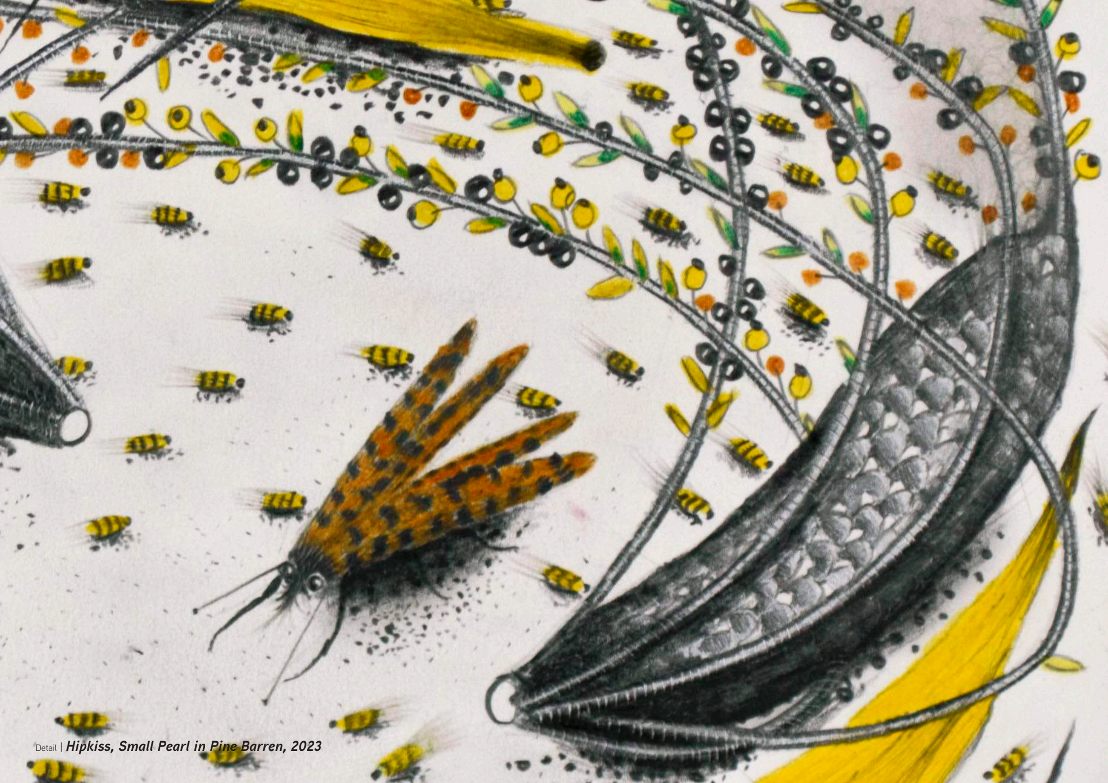
Detail | Hipkiss, Small Pearl in Pine Barren, 2023