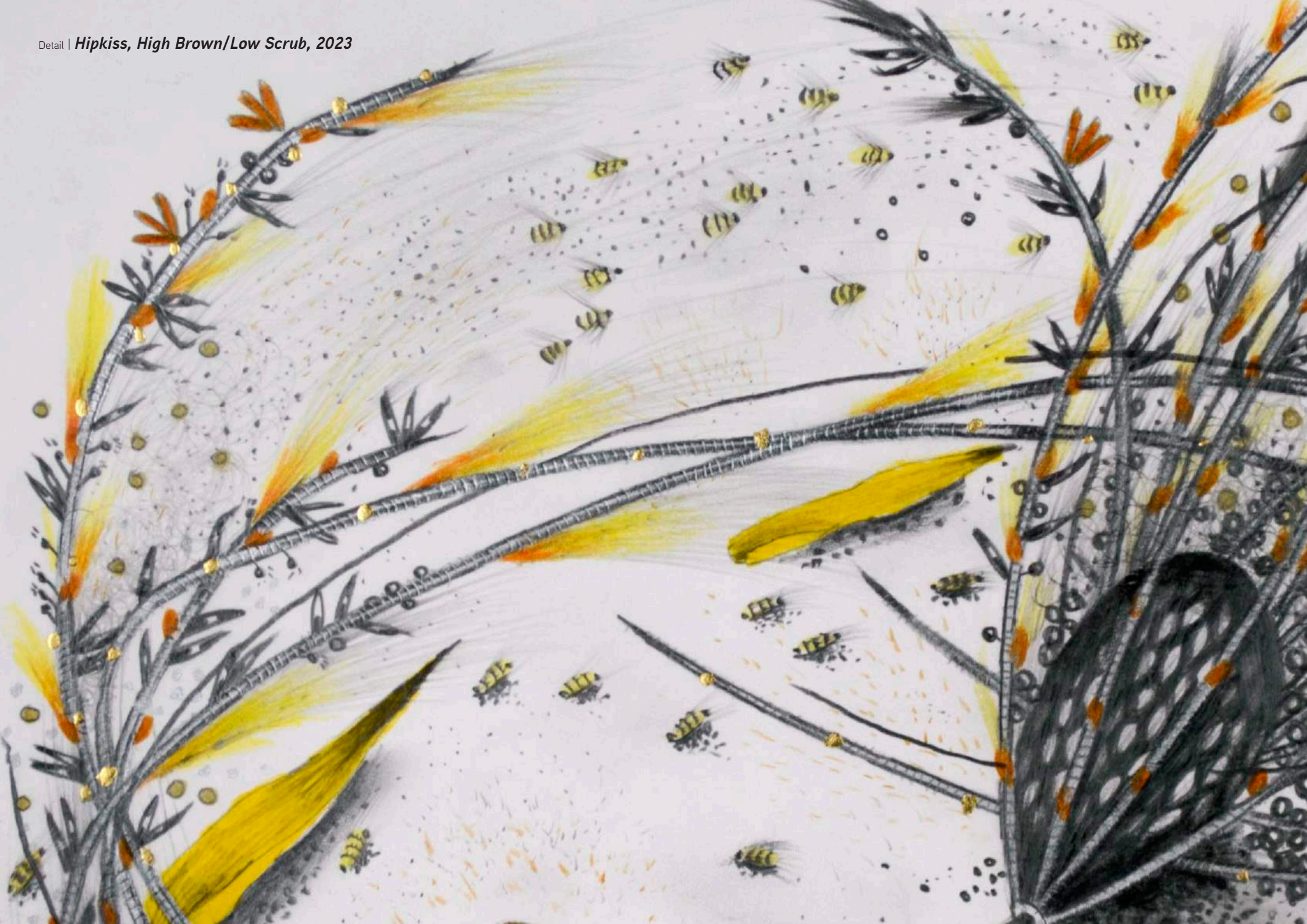
Detail | Hipkiss, High Brown/Low Scrub, 2023