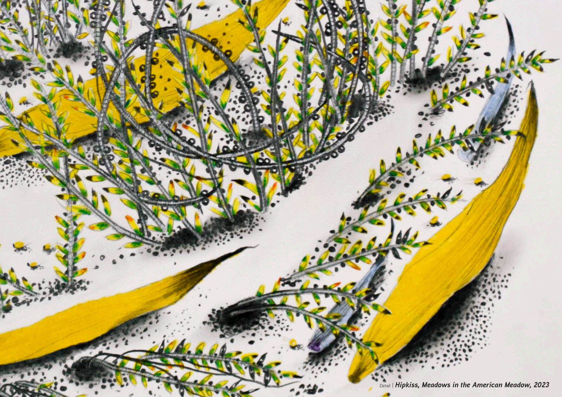
Detail | Hipkiss, Meadows in the American Meadow, 2023