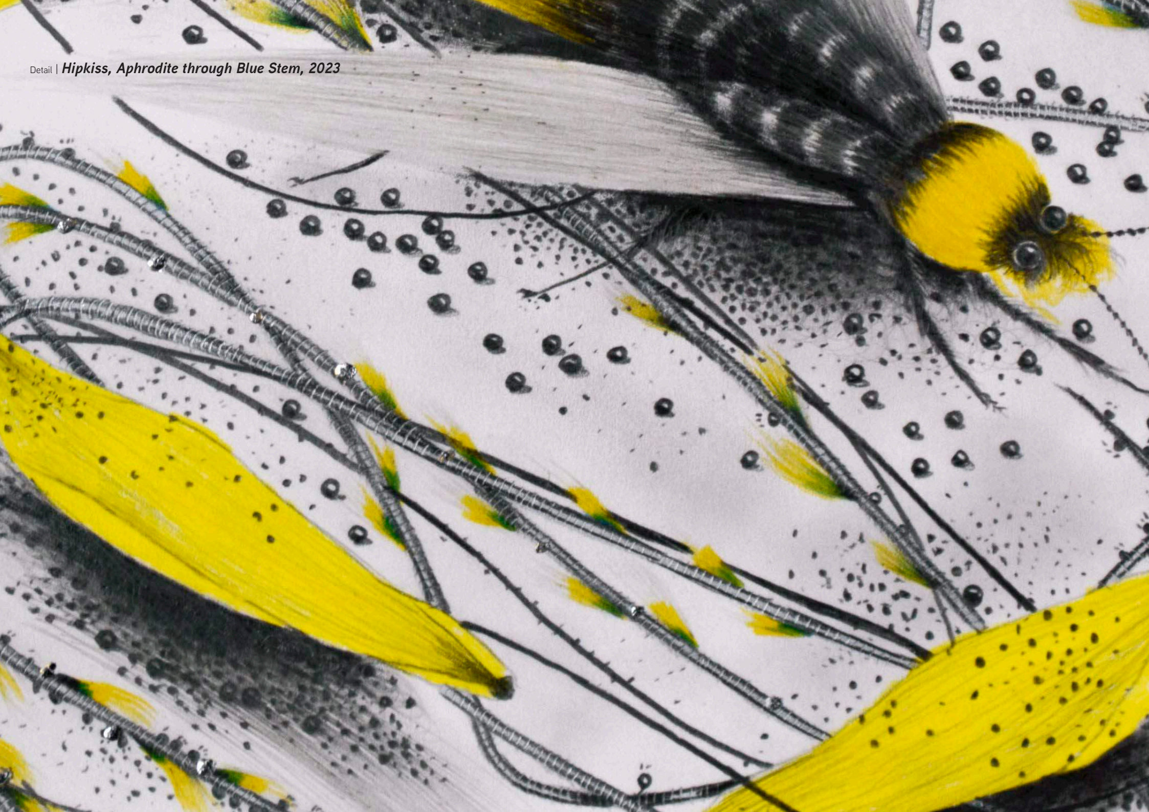
Detail | Hipkiss, Aphrodite through Blue Stem, 2023