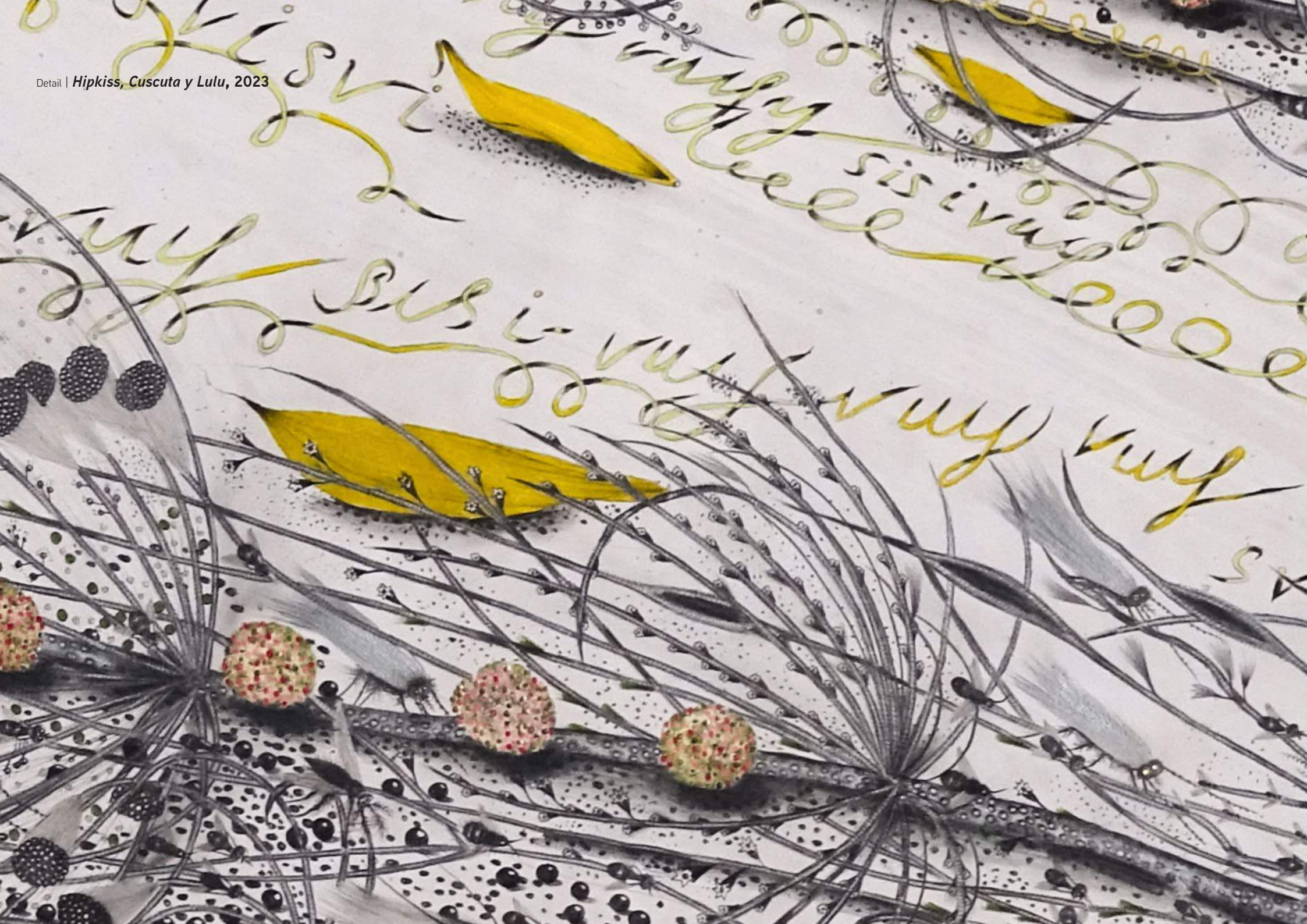
Detail | Hipkiss, Cuscuta y Lulu , 2023