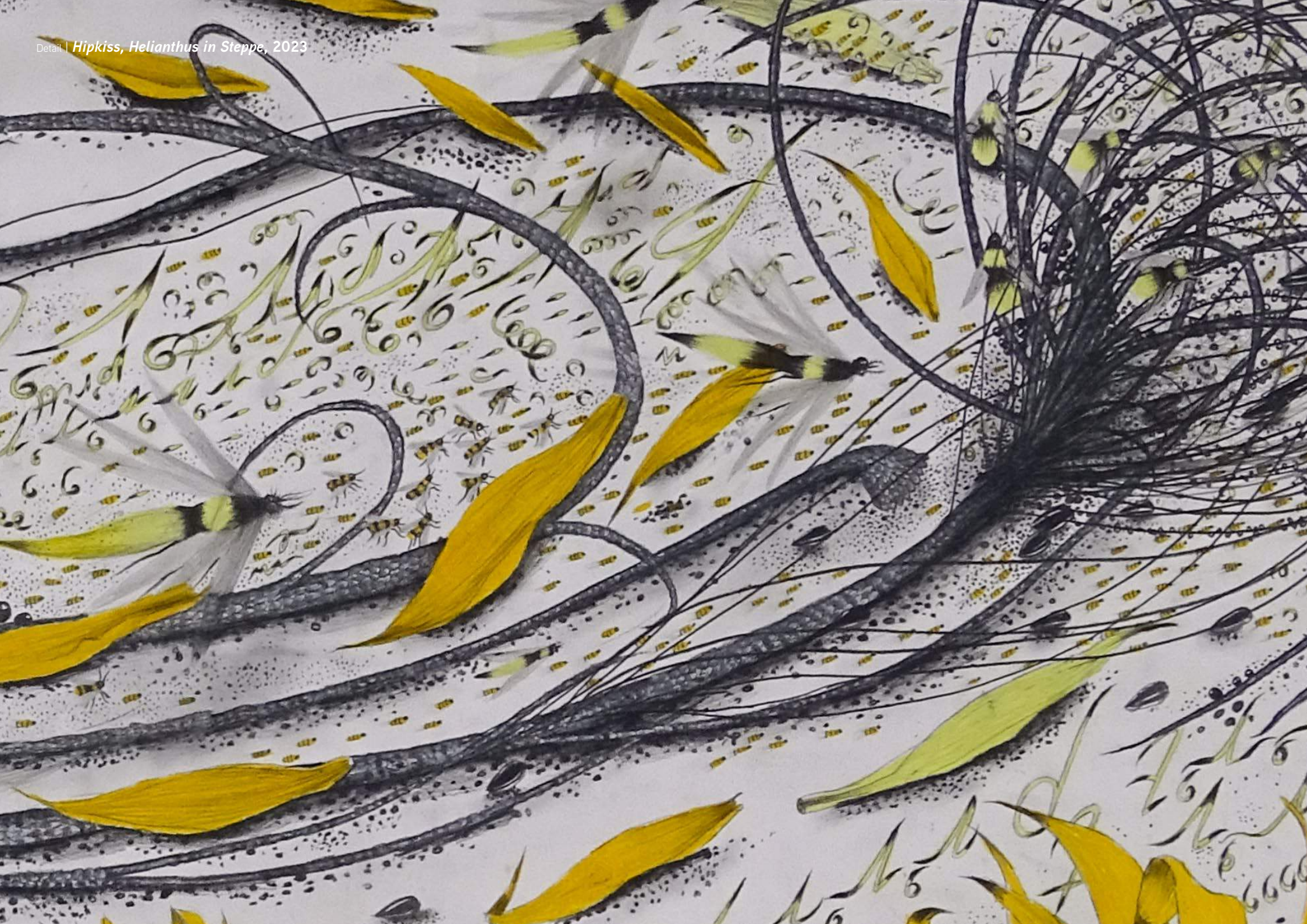
Detail | Hipkiss, Helianthus in Steppe, 2023