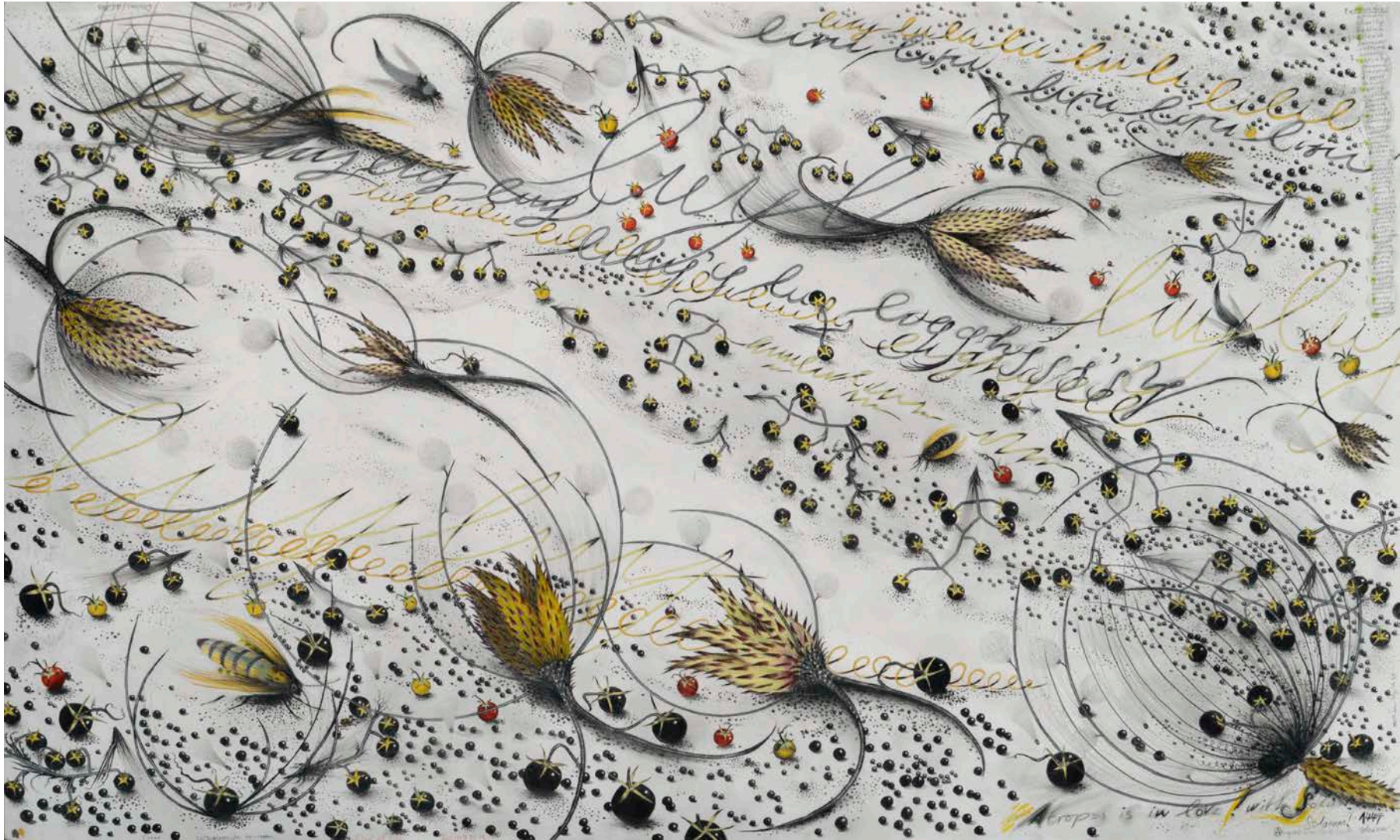
Hipkiss Atropos is in Love! With Solanum! , 2023 Graphite, silver ink, metal leaf and colored pencil on Fabriano 4 paper 60 x 100 cm | 23 1/2 x 39 1/4 in