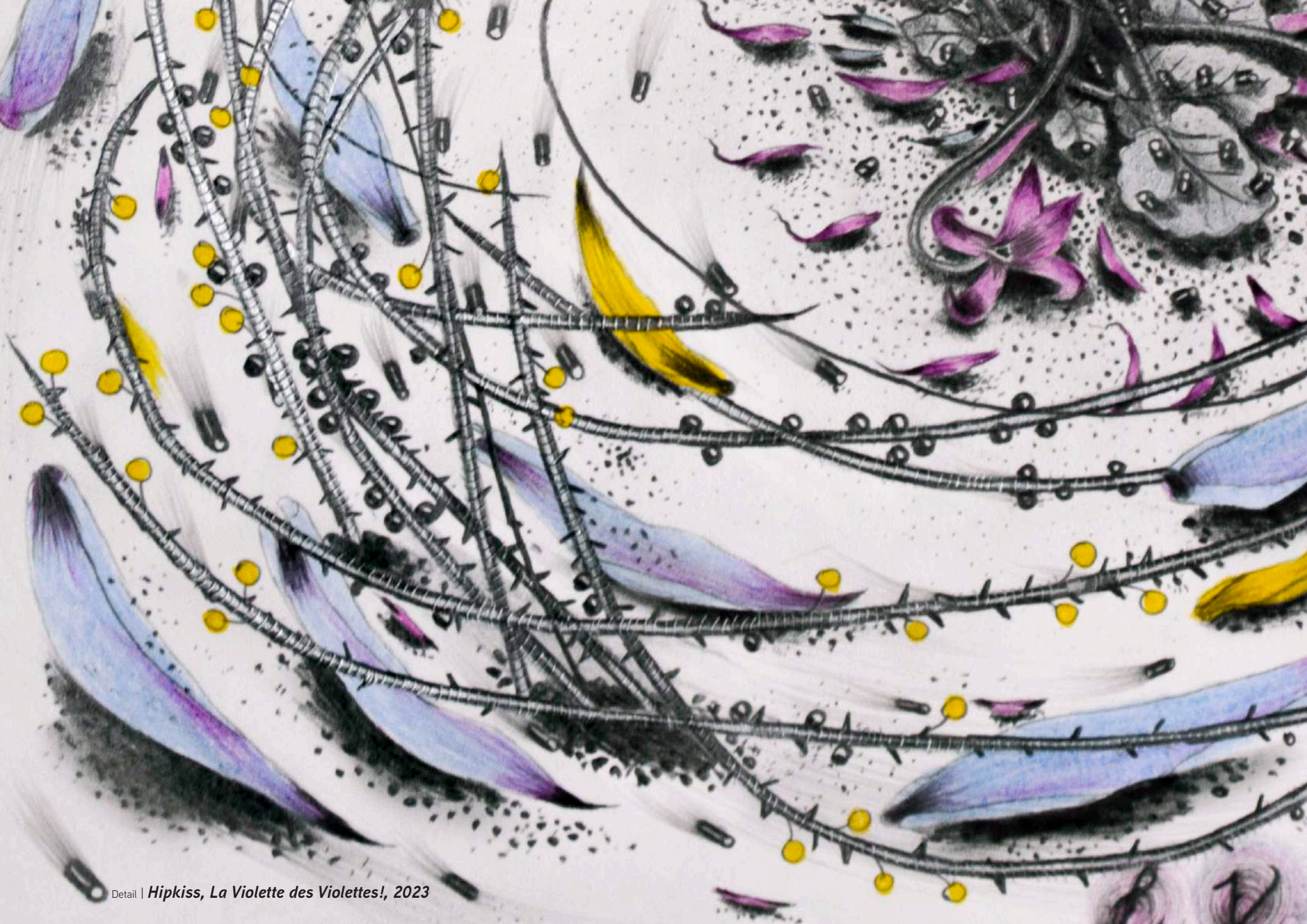
Detail | Hipkiss, La Violette des Violettes! , 2023