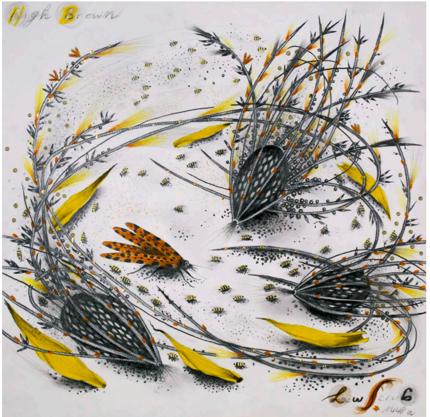
Hipkiss High Brown/Low Scrub, 2023 Graphite, silver ink, metal leaf and colored pencil on Fabriano 4 paper 25 x 25 cm | 9 3/4 x 9 3/4 in